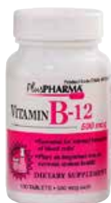
Vitamin B-12 † Item No. 1389 $6 51