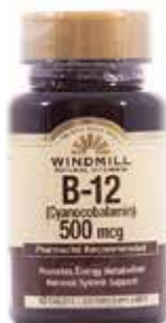
Vitamin B-12, Natural † Item No. 2082 $10 50