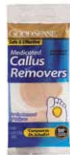
Callus Remover Pads Item No. 1238 $8 00 - Compare to Dr. Scholl's® - 6 ct