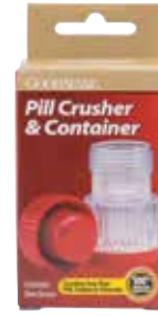
Pill Crusher with Storage Item No. 1933