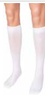
Compression Knee-High Socks, Men's White †