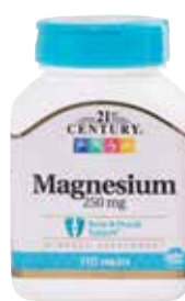
Magnesium † Item No. 1418