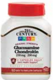
Glucosamine/Chondroitin (Joint Health Support) ‡ Item No. 1003