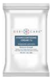
Hydrocortisone Cream (Wipes) Item No. 2357

$24 25 - Compare to Cortizone 10® - 144 ct/1%