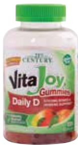
Vitamin D3 Gummy ‡ Item No. 1978 $14 11