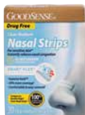
Nasal Strips, Medium Item No. 1724

$13 02 - Compare to Breathe Right® - 30 ct