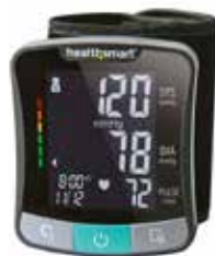
Blood Pressure Monitor, Wrist Talking † Item No. 1502