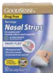
Nasal Strips, Large Item No. 1725

$13 02 - Compare to Breathe Right® - 30 ct