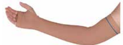
Arm Sleeve, Protective - X-Large Item No. 1899