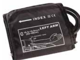
Blood Pressure Monitor, Desktop Replacement Cuff † Item No. 1504