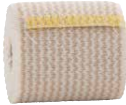
Bandage, Elastic - 2" x 4.5 yd Item No. 1207