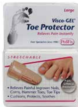
Toe Protector, Large Item No. 1787 $9.77