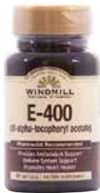
Vitamin E Soft Gels, Natural ‡ Item No. 2086 $13 02