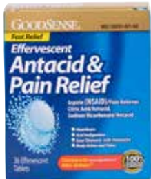
Effervescent Antacid & Pain Relief Item No. 1314