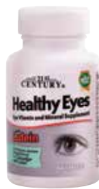
Healthy Eyes® with Lutein ‡ Item No. 1975