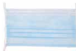
Face Masks, Procedural, with Earloops Item No. 1896

$5 43 - Compare to Benadryl Cream® - 1 oz