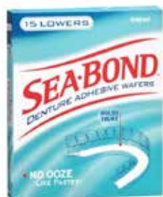
Denture Adhesive Wafers, Lowers, Sea-Bond® Item No. 2038