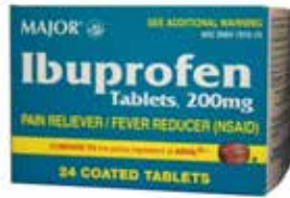
Ibuprofen (Pain Reliever/Fever Reducer) Item No. 2031