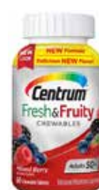
Multivitamin, Centrum Silver® Chewables † Item No. 1420