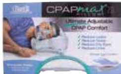
Pillow, CPAP, Memory Foam Item No. 1837