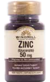
Zinc, Natural ‡ Item No. 2090 $10 50