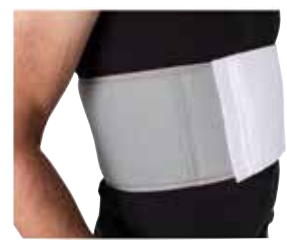
Rib Belt - Male (One Size Fits Most) Item No. 1456