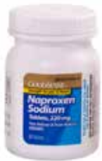
Naproxen Sodium (Pain Reliever/Fever Reducer) Item No. 2032