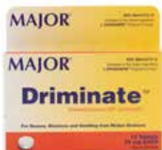
Dimenhydrate (Motion Sickness Tablets)