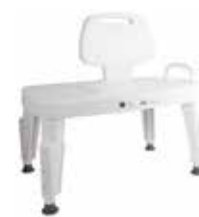
Transfer Bench, Adjustable Item No. 1764