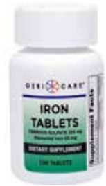
Ferrous Sulfate (Iron Supplement) ‡ Item No. 1376