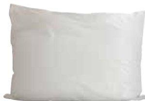
Pillow, Hypoallergenic Item No. 1936