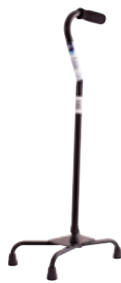
Cane, Quad, Large Base Item No. 1776