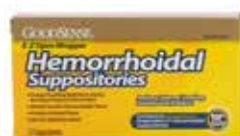
Hemorrhoidal Suppository Item No. 1247 $7.00