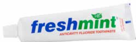
Toothpaste, Fluoride Item No. 1914