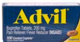
Advil® Item No. 2050

$16 28 - Compare to Tylenol Extra Strength® - 500 ct/500 mg