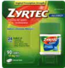
Zyrtec® (Allergy Tablets) Item No. 2302