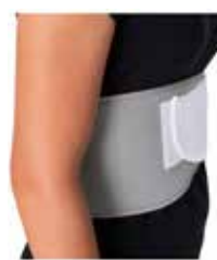
Rib Belt - Female (One Size Fits Most) Item No. 1457