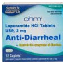
Loperamide HCL (Anti-diarrheal Tablets) Item No. 1133