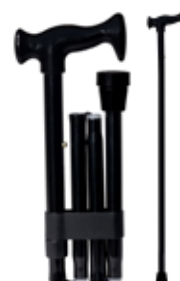
Cane, Folding, Ergonomic Handle Item No. 1726