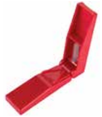
Pill Cutter with Safety Shield Item No. 1932