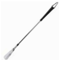
Shoe Horn, No Bend 24" Item No. 2339