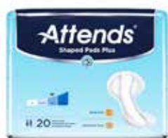
Bladder Control Shaped Pad, Heavy Absorbency Item No. 1479