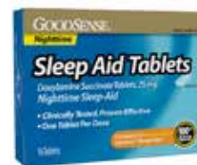
Sleep Aid Tablets Item No. 2362

$8 50 - Compare to Unisom® SleepTabs® - 16 ct/25 mg