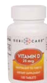
Vitamin D3 † Item No. 1390 $8 68