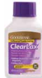
Laxative, ClearLax® Unflavored Powder Item No. 1969