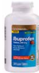
Ibuprofen (Pain Reliever/Fever Reducer) Item No. 2001