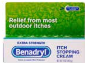
Benadryl® Extra Strength Itch Stopping Cream Item No. 2060