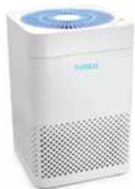
Air Purifier Item No. 2351