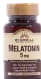
Melatonin, Natural † Item No. 2094

- Compare to Vitafusion® - 120 ct/2.5 mg