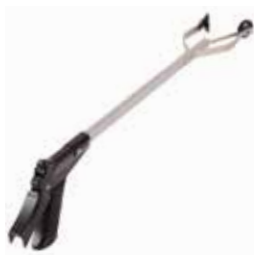
Reacher, Suction Cup 22" Item No. 2337