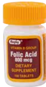
Folic Acid ‡ Item No. 1850