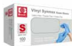
Gloves, Vinyl Small Item No. 2333 $10 50 - 100 ct