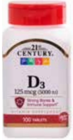
Vitamin D3 ‡ Item No. 1973 $10 85