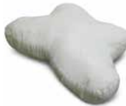
Pillow, CPAP, Fiber Filled Item No. 1836