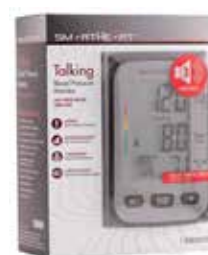
Blood Pressure Monitor, Desktop Talking † Item No. 1503