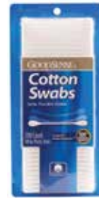
Cotton Tipped Swabs Item No. 1742