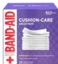
Gauze Pads, Band-Aid® - 2" x 2" Item No. 1676 $6 51 - 25 ct