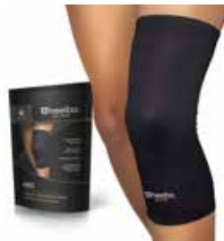
Arthritis Knee Sleeve • Small Item No. 2011 • Medium Item No. 2012 • Large Item No. 2013 • X-Large Item No. 2014