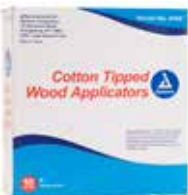
Cotton Tipped Applicator - 6" Item No. 1669