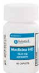
Meclizine HCL (Motion Sickness Caplets)