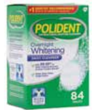
Polident® Overnight Whitening Tablets Item No. 1892