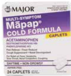
Multi-Symptom Cold Formula Item No. 1357