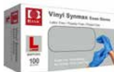
Gloves, Vinyl Large Item No. 2230 $17 36 - 100 ct