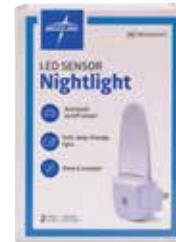
Nightlight Item No. 1983