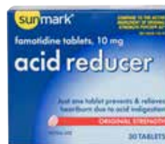
Famotidine (Acid Reducer) Item No. 1108