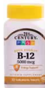
Vitamin B-12, Sublingual † Item No. 1974 $10 85