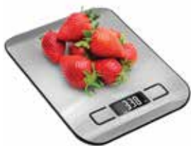
Scale, Kitchen, Digital† Item No. 2016