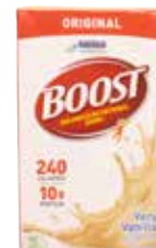
BOOST® Nutritional Supplement Shake, Vanilla