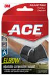
Elbow Support Item No. 1224