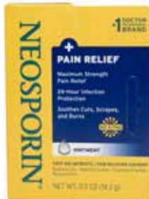
Neosporin® + Pain Relief Item No. 1326 $11 00 - .5 oz