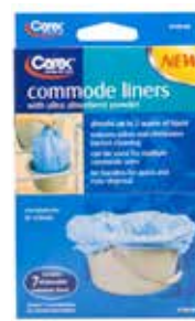
Commode Liner Item No. 2045