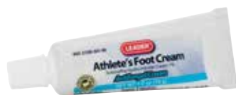
Terbinafine HCL (Athlete's Foot Cream) Item No. 1046