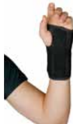
Wrist Splint Item No. 1230