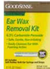
Ear Wax Removal System with Rubber Bulb Item No. 1363