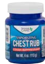
Vapor Rub Item No. 1164