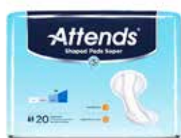
Bladder Control Shaped Pad, Maximum Absorbency Item No. 1480