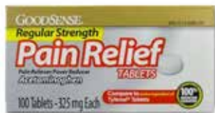
Acetaminophen (Pain Reliever, Regular Strength) Item No. 1001

$6 51 - Compare to Tylenol® - 100 ct/325 mg