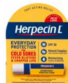
Herpecin-L® Lip Balm Item No. 1153