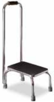
Foot Stool with Support Handle Item No. 2349