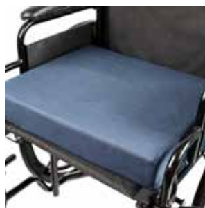
Wheelchair Cushion, Gel/Foam Seat Item No. 1466