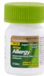
Cetirizine HCL (Allergy Tablets) Item No. 2003