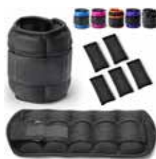
Exercise, Wrist & Ankle Weights Item No. 2348