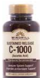
Vitamin C, Natural † Item No. 2084 $15 19