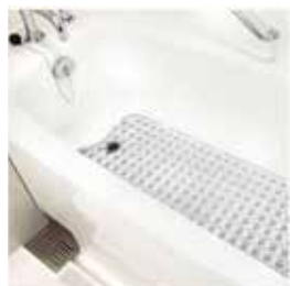
Bath Mat, Non-skid Item No. 1459