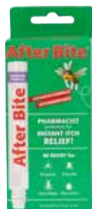
After Bite® Relief Item No. 1803