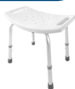
Bath Bench without Back Item No. 1727