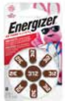
Hearing Aid Batteries

• Size 10 - Item No. 1431 - 8 ct • Size 13 - Item No. 1430 - 8 ct • Size 312 - Item No. 1429 - 8 ct