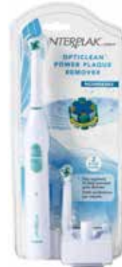
Toothbrush, Rechargeable Item No. 1450