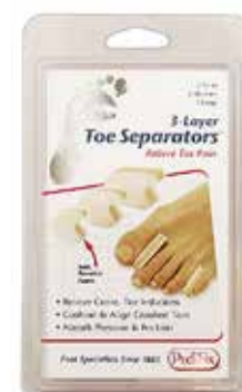
Toe Separator Item No. 1783 $7.60