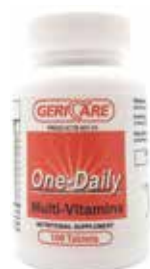
Multivitamin, Daily† Item No. 1393