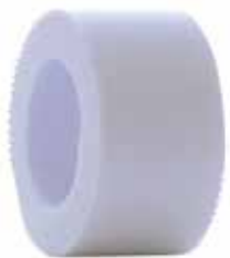
Tape, Silk Surgical - 1" x 10 yd Item No. 1219 $5 43 - Compare to 3M Tape® - 1 ct