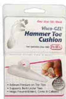
Hammer Toe Cushion Item No. 1785 $10.85