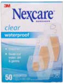
Bandages, Nexcare® Clear Waterproof, Assorted Sizes Item No. 1667