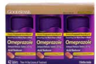
Omeprazole (Acid Reducer, Delayed Release) Item No. 1970