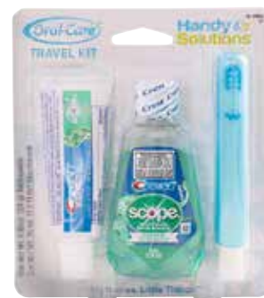
Dental Travel Kit Item No. 1749