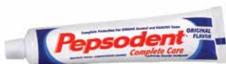
Toothpaste, Pepsodent® Item No. 1414