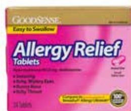
Diphenhydramine Antihistamine (Allergy Tablets) Item No. 1009