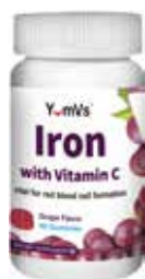
Iron with Vitamin C Gummy † Item No. 2236