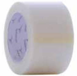
Tape, Paper Surgical - 1" x 10 yd Item No. 1217 $5 43 - Compare to 3M Tape® - 1 ct