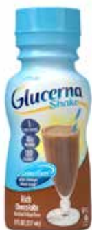
Glucerna® Shake, Chocolate