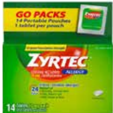
Zyrtec® (Allergy Tablets) Item No. 2303