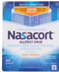
Nasacort® Item No. 1881