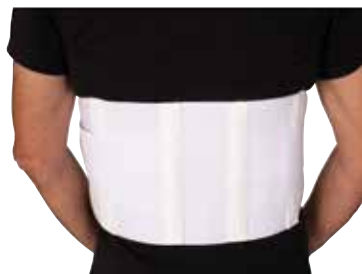
Back Support Elastic with Lumbar Item No. 1488