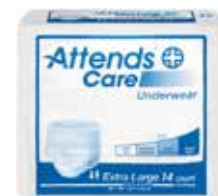
Disposable Underwear, X-Large - 58" to 68" Item No. 1027