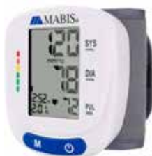
Blood Pressure Monitor, Wrist † Item No. 1501