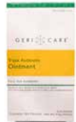
Triple Antibiotic Ointment (Packets) Item No. 2332 $26 25 - Compare to Neosporin® - 144 ct