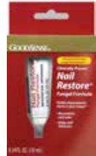
Nail Restore Fungal Formula (Anti-fungal Cream) Item No. 2305