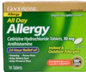
Cetirizine HCL (Allergy Tablets) Item No. 1090