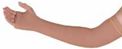
Arm Sleeve, Protective - Large Item No. 1898