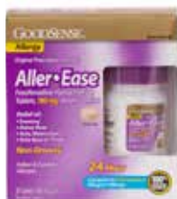
Fexofenadine (Allergy Tablets) Item No. 1804