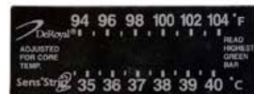
Thermometer, Fever Strip Item No. 1794