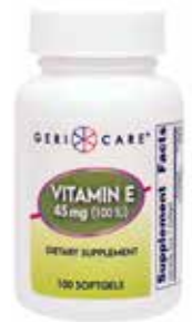
Vitamin E Soft Gels ‡ Item No. 1391 $6 51