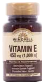
Vitamin E Soft Gels, Natural ‡ Item No. 2087 $12 60