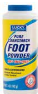
Foot Powder, Medicated Item No. 1240 $7.60