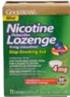
Nicotine Lozenges † Item No. 1281