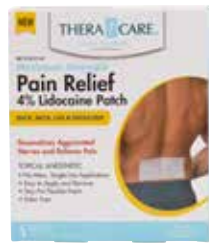
Lidocaine Patch Item No. 1871