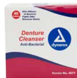
Denture Cleaning Tablets Item No. 1032