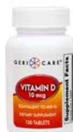
Vitamin D3 † Item No. 1383 $6 51