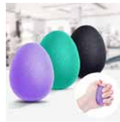
Stress Ball Item No. 2344