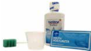
Oral Care System Kit Item No. 1750