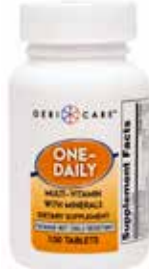
Multivitamin, Daily, with Minerals† Item No. 1385