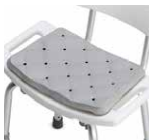
Bath Seat Cushion Item No. 2310