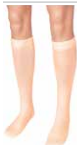
Compression Knee-High Socks, Women's Beige