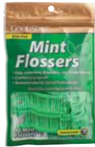
Interdental Flossups Item No. 1751