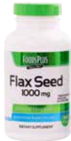
Flaxseed ‡ Item No. 1849