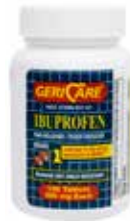
Ibuprofen (Pain Reliever/Fever Reducer) Item No. 1004