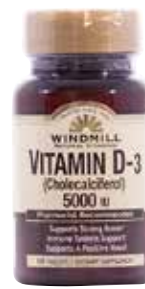
Vitamin D3, Natural ‡ Item No. 2078 $12 60