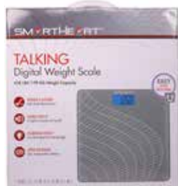
Bathroom Scale, Talking † Item No. 1981