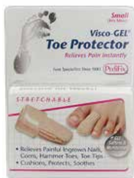
Toe Protector, Small Item No. 1788 $9.77