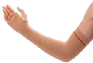
Arm Sleeve, Protective - Small Item No. 1897