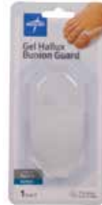
Bunion Guard Item No. 1784 $9 77 - 1 ct