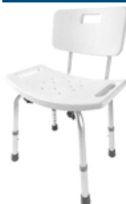
Bath Bench with Back Item No. 1728