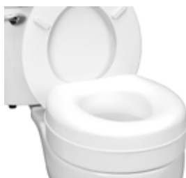
Toilet Seat, Raised Item No. 1729