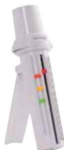
Peak Flow Meter † Item No. 1789