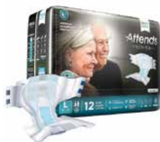
Premier® Adult Briefs, Large - 44" to 58" Item No. 1994