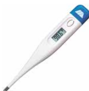
Thermometer, Digital, 60 seconds Item No. 1063