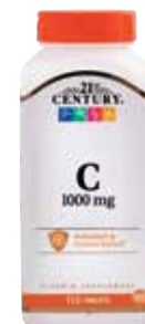
Vitamin C † Item No. 1706 $11 94