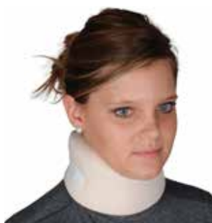
Cervical Collar Item No. 1241