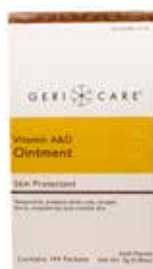
A & D Ointment (packets) Item No. 2330