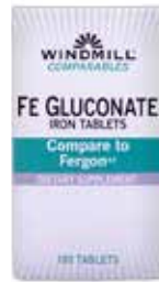
Ferrous Gluconate (Iron Supplement), Natural ‡ Item No. 2073