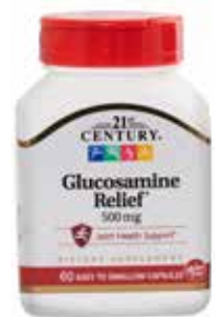
Glucosamine (Joint Health Support) ‡ Item No. 1114