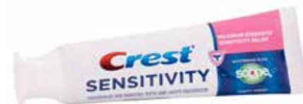
Toothpaste, Crest® Sensitivity Item No. 1838