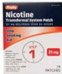
Nicotine Patch, Step 1 † Item No. 1369