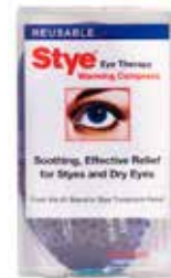
Eye Compress, Stye® Item No. 1905

- Compare to Renu® Multi-Purpose Solution - 12 oz