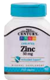
Zinc, Chelated ‡ Item No. 1419 $7 75