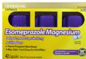
Esomeprazole Magnesium (Acid Reducer, Delayed Release) Item No. 1949