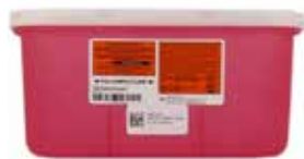
Sharps Container, 1 Gallon Item No. 1799