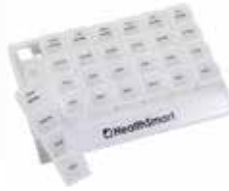
Pill Case, Weekly AM/PM Item No. 1934