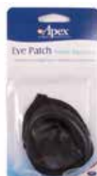
Eye Patches Item No. 1516