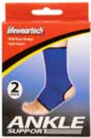
Ankle Support Item No. 1225