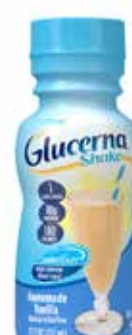
Glucerna® Shake, Vanilla