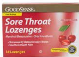
Sore Throat Lozenges, Cherry Item No. 1176