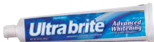
Toothpaste, Ultrabrite® Advanced Whitening Item No. 1716