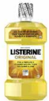
Mouth Rinse, Listerine® Original Item No. 2311