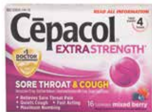
Sore Throat Lozenges, Cepacol® Item No. 1360