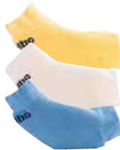
Heel & Elbow Protector