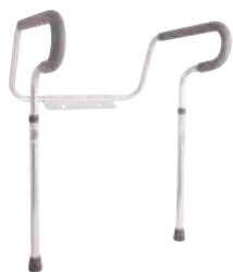
Toilet Safety Rails Item No. 1779