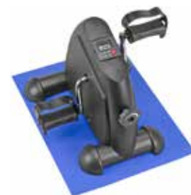
Pedal Exerciser, Deluxe Item No. 2340