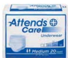
Disposable Underwear, Medium - 34" to 44" Item No. 1021