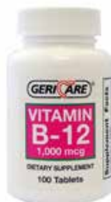
Vitamin B-12 † Item No. 1381 $8 68