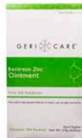
Bacitracin Ointment (packets) Item No. 2331