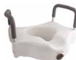
Toilet Seat, Raised, with Arms Item No. 1950