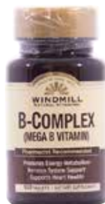
Vitamin B-Complex, Natural † Item No. 2079 $10 85