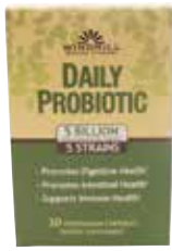
Daily Probiotic ‡ Item No. 1204