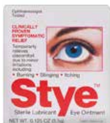
Eye Ointment, Styel® Item No. 1906