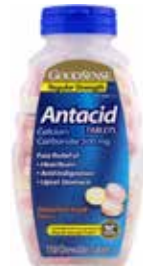
Antacid Chewables Item No. 1346