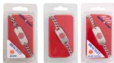
Medical ID Bracelet • Blank Item No. 1875 1 ct $17 90

• Diabetic Item No. 1877 1 ct • Heart Item No. 1876 1 ct