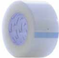
Tape, Transparent Surgical - 1" x 10 yd Item No. 1221 $3 80 - Compare to 3M Tape® - 1 ct