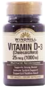
Vitamin D3, Natural ‡ Item No. 2077 $10 50