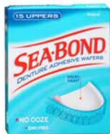
Denture Adhesive Wafers, Uppers, Sea-Bond® Item No. 2039