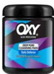
Oxy® Daily Cleansing Pads, Maximum Strength Item No. 2056