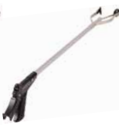
Reacher, Suction Cup 33" Item No. 2338