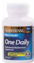
Multivitamin, One Daily Men's† Item No. 1886