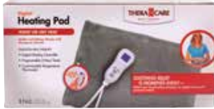
Heating Pad, Digital, 12" x 15" Item No. 2024