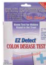
EZ Detect ® Colon Cancer Test Kit † Item No. 1416