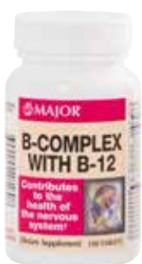
Vitamin B-Complex † Item No. 1382 $6 51