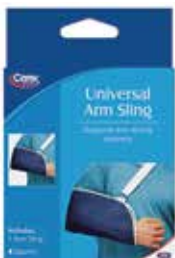
Arm Sling Item No. 2041