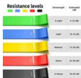
Exercise, Resistance Bands Item No. 2346