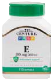
Vitamin E Soft Gels ‡ Item No. 1384 $9 77