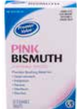
Pink Bismuth Chewable Tablets Item No. 1045