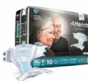
Premier® Adult Briefs, X-Large - 58" to 63" Item No. 1995