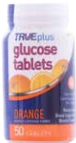
Glucose Tablets Item No. 1997