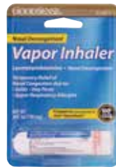
Nasal Decongestant Inhaler - Levmetamfetamine Item No. 1922