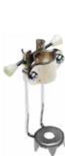
Cane Ice Grip Attachment Item No. 2241