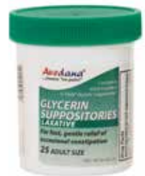
Laxative, Glycerin Suppository Item No. 1125