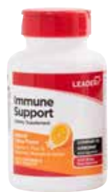
Immune Support Chewables ‡ Item No. 1866