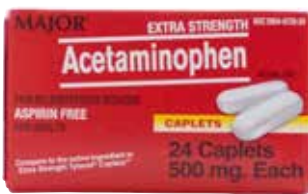
Acetaminophen (Pain Reliever, Extra Strength) Item No. 2030

$6 51 - Compare to Tylenol® - 100 ct/325 mg