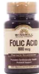
Folic Acid, Natural ‡ Item No. 2093