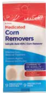
Corn Remove Pads Item No. 1236 $7.60