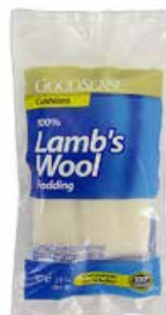
Lamb's Wool Padding Item No. 1786 $5.00