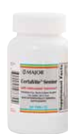
Multivitamin, Senior† Item No. 1392

- Compare to One-A-Day Women's® - 100 ct