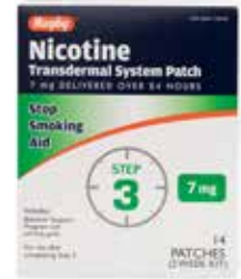
Nicotine Patch, Step 3 † Item No. 1371