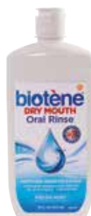
Dry Mouth Oral Rinse, Biotene® Item No. 1817