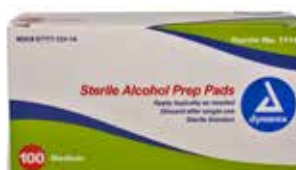
Alcohol Pads Item No. 1200