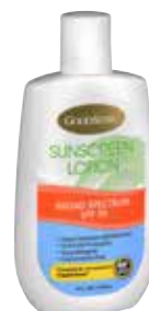
Sunscreen Lotion SPF 30 Item No. 1284