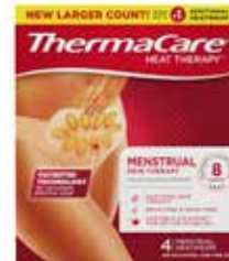
ThermaCare® Menstrual Relief Item No. 1913