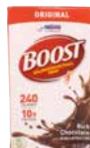
BOOST® Nutritional Supplement Shake, Chocolate