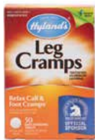
Leg Cramps Pain Relief Caplets † Item No. 1869