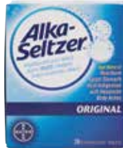
Alka-Seltzer® Item No. 1313