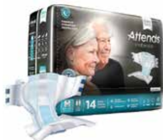
Premier® Adult Briefs, Medium - 32" to 44" Item No. 1993