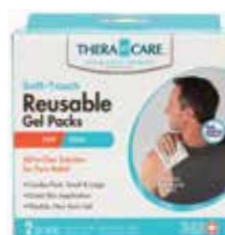
Hot/Cold Pack, 1 Small & 1 Large Item No. 1062 $9 77 - 1 ct