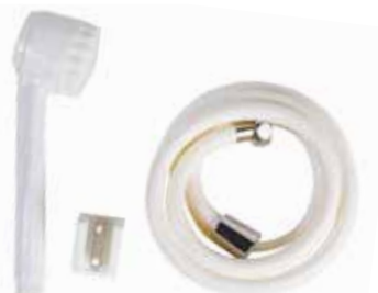
Shower Head, Handheld Item No. 2007