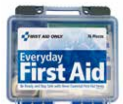
First Aid Kit, 76 Pieces Item No. 1215