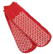
Slipper Socks, Treaded, One Size Fits Most Item No. 2008