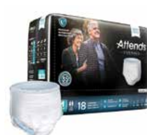
Premier® Disposable Underwear, Medium - 36" to 44" Item No. 1990