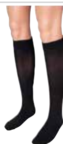
Compression Knee-High Socks, Women's Black