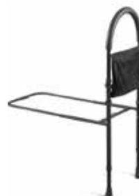
Bed Assist Bar Item No. 2009