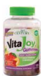
Multivitamin Gummy, Daily† Item No. 1972

- Compare to One-A-Day Essential® - 100 ct