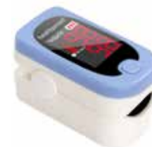
Finger Pulse Oximeter † Item No. 1505