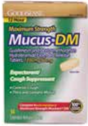
Mucus Relief DM Expectorant & Cough Suppressant, Extended Release Item No. 1965