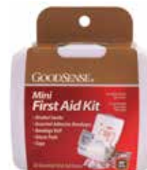
First Aid Kit, 20 Pieces Item No. 1947