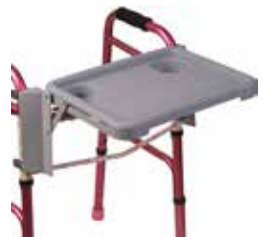
Tray Walker, Fold Away Item No. 2350