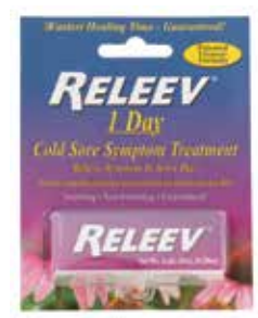
Releev® Cold Sore Treatment Item No. 1359