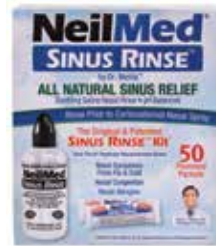
Nasal Rinse Kit, Saline Item No. 1931