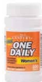
Multivitamin, One Daily Women's† Item No. 1887