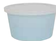
Denture Case Item No. 1515