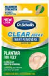
Wart Removal System, Dr. Scholl's® Item No. 1288 $15 19