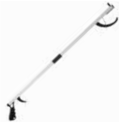
Reacher, Aluminum, Magnetic Tip 32" Item No. 2336