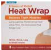
Heat Wrap - Neck, Shoulder & Wrist Item No. 1860