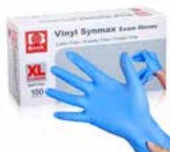
Gloves, Vinyl XL Item No. 2334 $10 50 - 100 ct