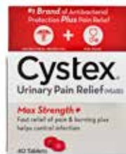
Urinary Pain Relief Tablets Item No. 2036