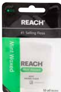
Dental Floss, Reach® Waxed - Mint Item No. 1455