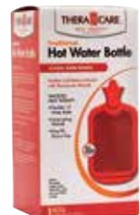
Warm or Cold Water Bottle, Rubber Latex Item No. 1781