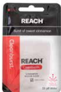
Dental Floss, Reach® Waxed - Cinnamon Item No. 1901