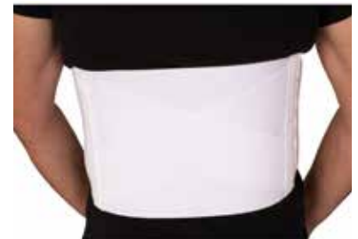
Back Support Elastic - 24" to 46" Item No. 1487