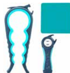
Jar Opener Item No. 2343

- Compare to Vicks® Ultrasonic Humidifier - 1 ct