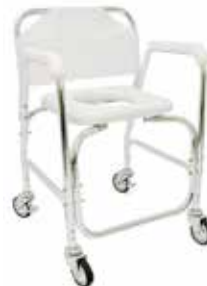
Shower Chair Transport Item No. 2309