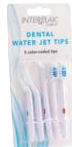
Water Jet Replacement Tips Item No. 1743