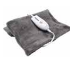
Heating Pad, 12" x 15" Item No. 1861