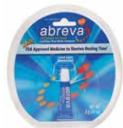
Abreva® Item No. 1152