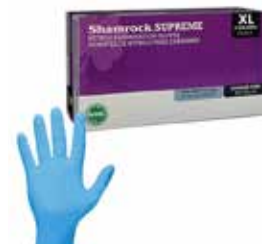
Gloves, Nitrile XL Item No. 2329 $12 50 - 100 ct