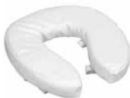
Toilet Seat Cushion, Vinyl Item No. 2308