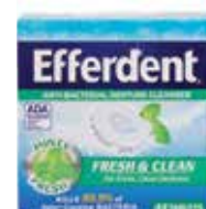
Efferdent® Plus Mint Tablets Item No. 1653