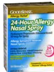
Fluticasone Propionate (Allergy Nasal Spray, 24-Hour) Item No. 1946