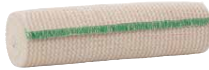
Bandage, Elastic - 6" x 5 yd Item No. 1213