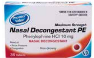
Phenylephrine HCL (Nasal Decongestant PE) Item No. 1352