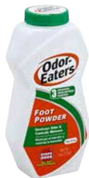
Odor-Eaters® Foot Powder Item No. 2335 $9.50