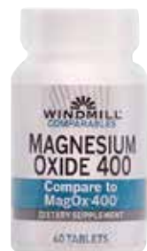
Magnesium, Natural † Item No. 2089