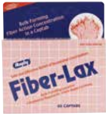
Fiber Tablets ‡ Item No. 1155