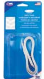
Safety Treads, Tub & Stair Item No. 1780