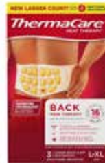
ThermaCare® Lower Back & Hip Item No. 1912