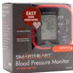
Blood Pressure Monitor, Desktop Automatic † Item No. 1253