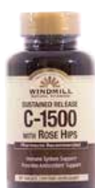
Vitamin C, with Rose Hips, Natural † Item No. 2085 $15 75