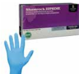
Gloves, Nitrile Small Item No. 2328 $12 50 - 100 ct