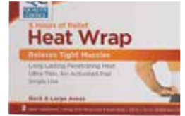
Heat Wrap - Back & Hip Item No. 1859