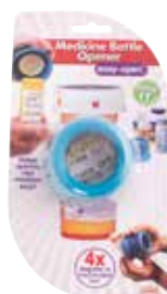
Medicine Bottle Opener with Magnifier Item No. 2017