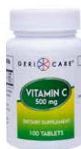
Vitamin C † Item No. 1017 $6 51