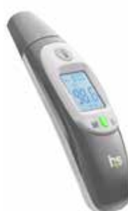
Thermometer, Digital, Ear Item No. 1285