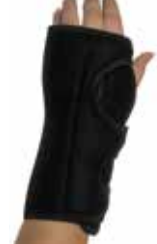
Wrist Support, Night Item No. 1463