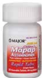
Acetaminophen (Children's Pain Relief Chewables) Item No. 1423