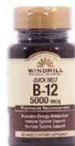
Vitamin B-12, Sublingual, Natural † Item No. 2083 $18 90