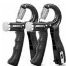
Exercise, Hand Strengtheners Item No. 2347