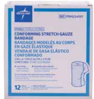
Bandages, Gauze Sterile, Conforming Stretch - 3" x 4.1 yd Item No. 1223