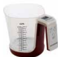
Measuring Cup Scale† Item No. 2214