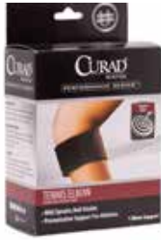
Elbow Support, Tennis Item No. 2040