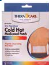
Cold/Hot Menthol Medicated Patch