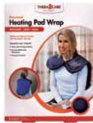
Heating Pad Wrap For Shoulder, Neck and Back, 25" x 26" Item No. 1943