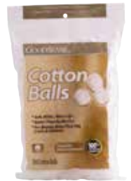
Cotton Balls Item No. 1763