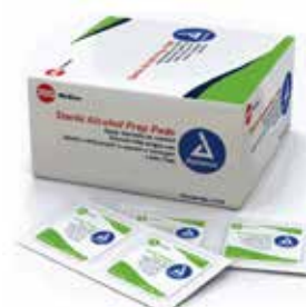
Alcohol Pads Item No. 2004