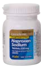
Naproxen Sodium (Pain Reliever/Fever Reducer) Item No. 1041