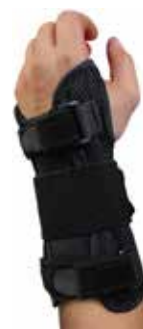
Carpal Tunnel Brace