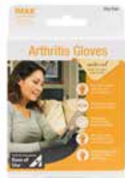
Arthritis Gloves • Small Item No. 1767 • Medium Item No. 1766 • Large Item No. 1765