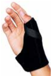
Thumb Brace Item No. 1778