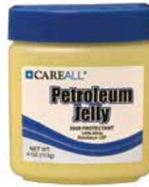
Petroleum Jelly Item No. 2018 $6 75 - Compare to Vaseline® - 4 oz