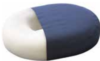
Cushion, Foam Ring Item No. 1732