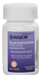
Guaifenesin (Cough Expectorant) Item No. 1180

- Compare to Robitussin® Sugar-Free DM - 4 oz/20 mg, 200 mg