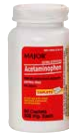
Acetaminophen (Pain Reliever, Extra Strength) Item No. 1105

$4 00 - Compare to Tylenol Extra Strength® - 24 ct/500 mg