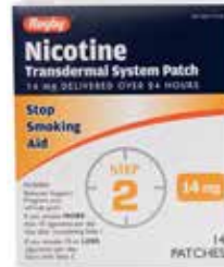
Nicotine Patch, Step 2 † Item No. 1370