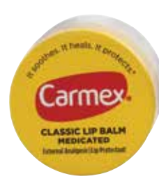
Carmex® Item No. 1255