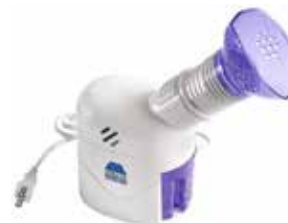
Inhaler, Personal Steam Item No. 1792