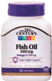
Fish Oil Soft Gels ‡ Item No. 1741