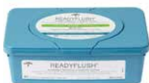
Flushable Wipes Item No. 2000