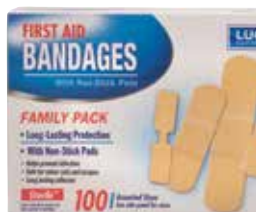
Adhesive Bandages Item No. 1344