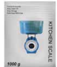
Scale, Kitchen, Dial† Item No. 1756