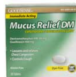
Mucus Relief DM Expectorant & Cough Suppressant (Guaifenesin/ Dextromethorphan HBr) Item No. 1178

- Compare to Vicks® Personal Steam Inhaler - 1 ct