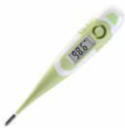
Thermometer, Flexible Tip, Digital, 9 seconds Item No. 1697