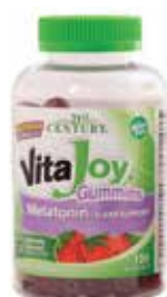
Melatonin Gummy † Item No. 1971