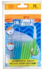
Interdental Gum Brushes Item No. 1748