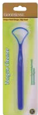
Tongue Cleaner Item No. 1746