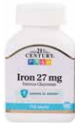
Ferrous Gluconate (Iron Supplement) ‡ Item No. 1417