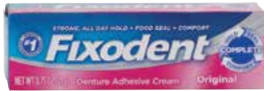
Fixodent® Item No. 1187