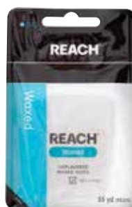
Dental Floss, Reach® Waxed - Unflavored Item No. 1902