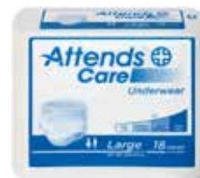
Disposable Underwear, Large - 44" to 58" Item No. 1026