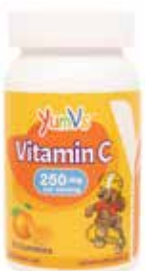
Vitamin C Gummy † Item No. 1916 $11 94