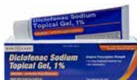
Diclofenac Sodium Topical Gel