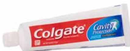
Toothpaste, Colgate® Item No. 1831