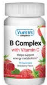
Vitamin B-Complex Gummy † Item No. 1915 $13 02