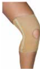
Knee Support, Elastic, with Stays