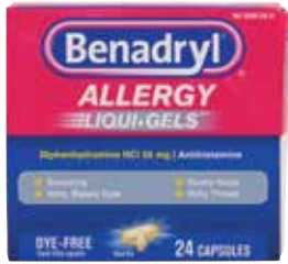
Benadryl® Allergy Liqui-Gels Dye-Free Item No. 1927