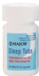
Sleep Tablets Item No. 1276

$13 02 - Compare to Breathe Right® - 30 ct