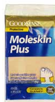
Moleskin Sheets Plus Item No. 1782 $5.75