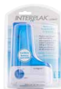
Water Jet Item No. 1744