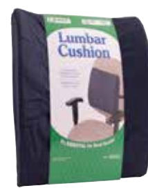
Cushion, Lumbar Item No. 1731