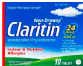
Claritin® (Allergy Tablets, 24-Hour) Item No. 2300