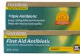
Triple Antibiotic Ointment Item No. 1014 $7 00 - Compare to Neosporin® - 1 oz