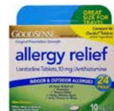
Loratadine (Allergy Tablets) Item No. 2033

- Compare to Flonase® - 144 sprays/50 mcg