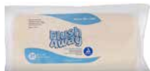
Flushable Wipes Item No. 1928