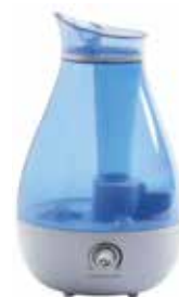
Humidifier, Ultrasonic Cool Mist Item No. 1795