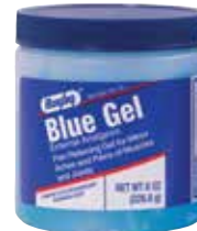
Menthol Gel Item No. 1923

- Compare to Aspercreme® Lidocaine Patch - 5 ct/4%