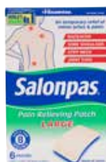
Salonpas® Pain Relief Patches Item No. 1739