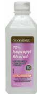
Isopropyl Alcohol Item No. 1713 $6 00 - 16 oz/70%