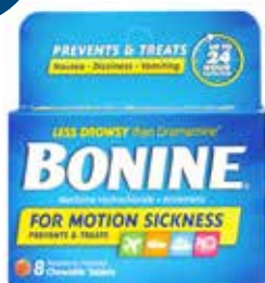
Bonine® Chewables, Raspberry