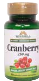
Herbal Cranberry Supplement ‡ Item No. 1206