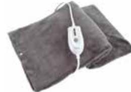
Heating Pad, X-Large, 12" x 24" Item No. 1942