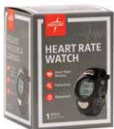
Heart Rate Monitor Watch † Item No. 1771