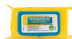
Preparation H® Medicated Wipes Item No. 1895 $14.11