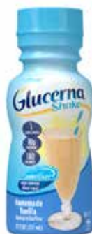
Glucerna® Shake, Vanilla