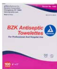
Antiseptic Towelettes Item No. 1201