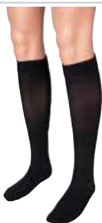
Compression Knee-High Socks, Men's Black †