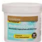
Pre-moist Hemorrhoid Pads Item No. 1364 $9.28