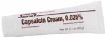
Capsaicin (Pain Relief Cream) Item No. 1367